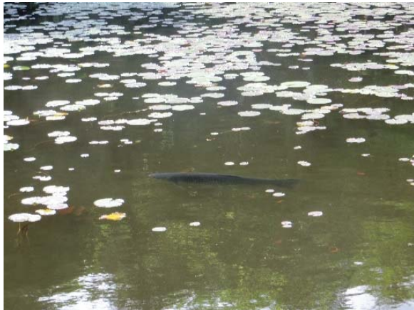
Grass carp over 42 inches

The Conservation Officers are routinely visiting our lake. Make sure your fishing and boating activities comply with DEP regulations. This year free fishing days (no license required) are May 26th (Memorial Day) and July 4th.