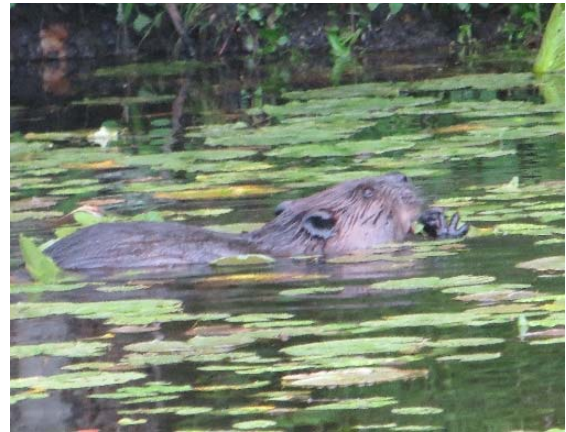
Beavers love lily pad flowers

When you're on the lake have a camera available. I was lucky to photograph a grass carp with the sun behind my back. Normally they spook and take off. This carp was over 42 inches long. To provide prospective, the lily pads in the background were about 6-8 inches wide. I was also able to capture a picture of a beaver eating the flower that grows from lily pads. In the spring beaver will swim from the east side to the west side of the lake because these flowers bloom earlier on the west side.