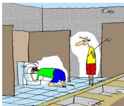
"Be honest...what did you think of my golf swing?"